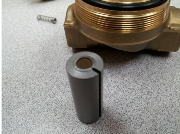
Inspect the gasket in bottom of the plunger