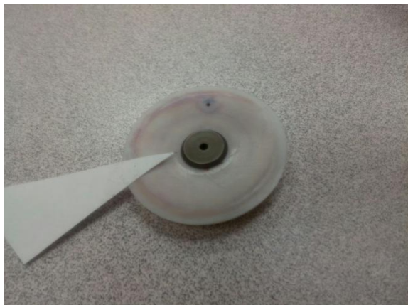
Failure to notice indents at sealing ring 4/29/2013