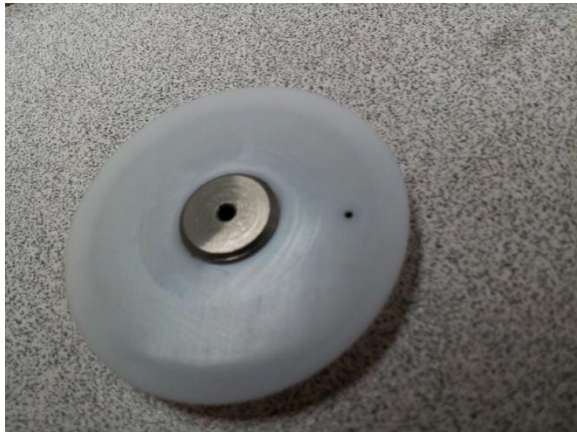
Turn over the diaphragm inspect near the rivet head