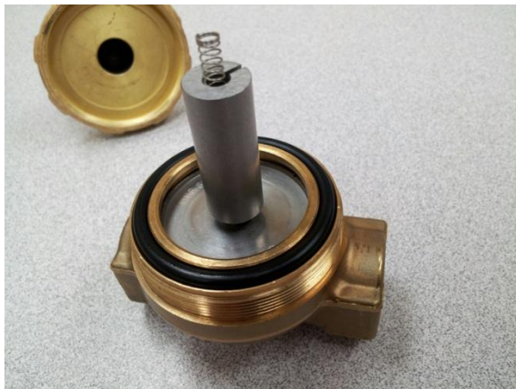
Correct plunger placement, spring on top