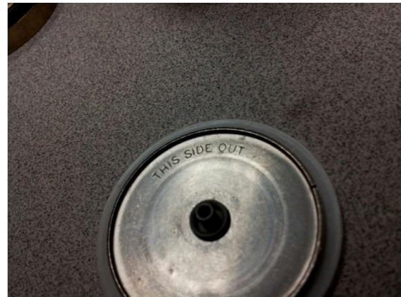
Installing diaphragm upside down, see lettering up