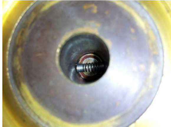
Failing to remove spring lodged in tube