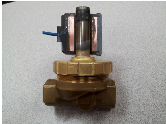
Coil will lift plunger in the tube.