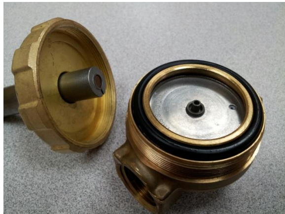
Twist to remove top, RH threads, first close water pressure to valve then twist top