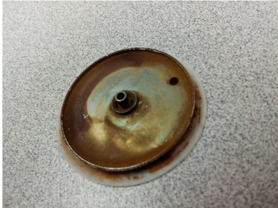
Errors are returning a corroded diaphragm to service.