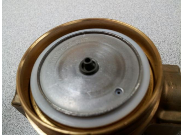
It must seal the top of the rivet shown here