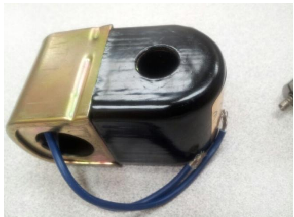
If voltage is at the coil but plunger will not lift, bad coil