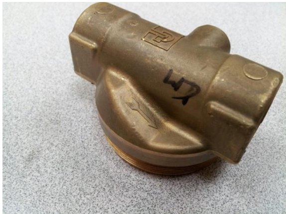
Installing valve wrong way, see arrow flow direction