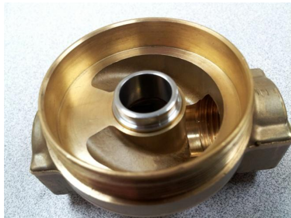
Remove any material or debris from the body. Inspect