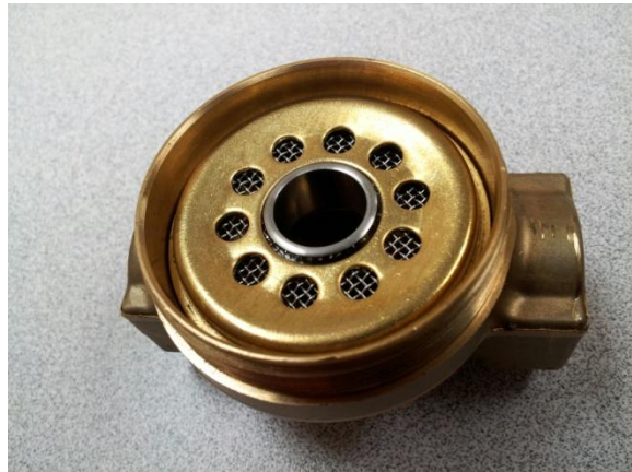
A cut or indent would stop sealing on the center ring