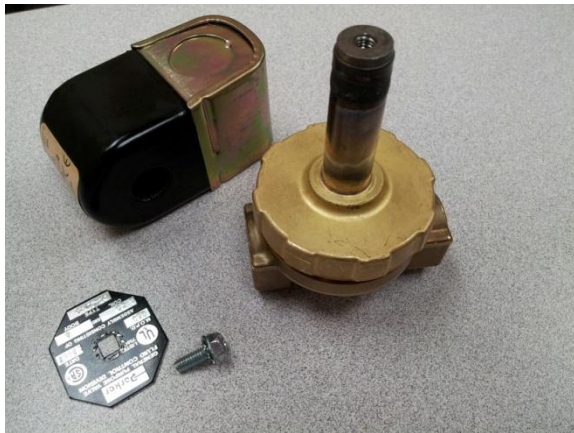
Remove screw and coil from tube