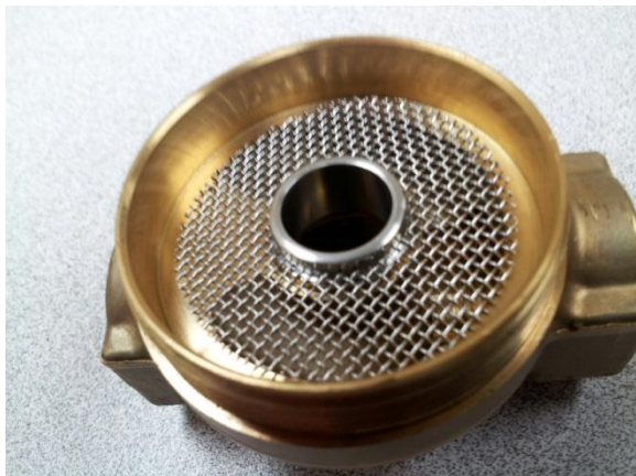
Remove the o-ring retainer, remove the screen the center ring for cuts or damage to the surface. If the stainless seat (center ring ) is rough or cut, the valve body must be replaced.